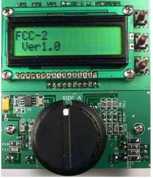
FCC-1 & FCC-2 Frequency Counter and DDS

OZY $137 TAPR member - $149 non member + S/H