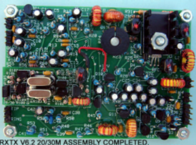
RXTX V6.2 20/30M ASSEMBLY COMPLETED WORKS AS ADVERTISED - JIM KB2XJ SEP 1 200

40m/30m kit with crystals for center frequencies of 7.014 MHz, 7.055 MHz and 10.124 MHz (omit any crystal for $1 price reduction)