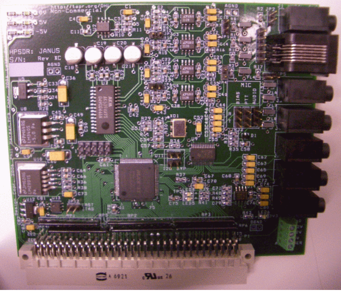
Janus $163 TAPR member - $179 non member +S/H

SoftRock: – <u>http://groups.yahoo.com/group/softrock40/</u> Rocky Software – <u>http://www.dxatlas.com/rocky/</u>